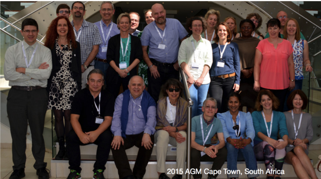
2015 AGM Cape Town, South Africa

The call for proposals to host GOBLET's 6th AGM is open: