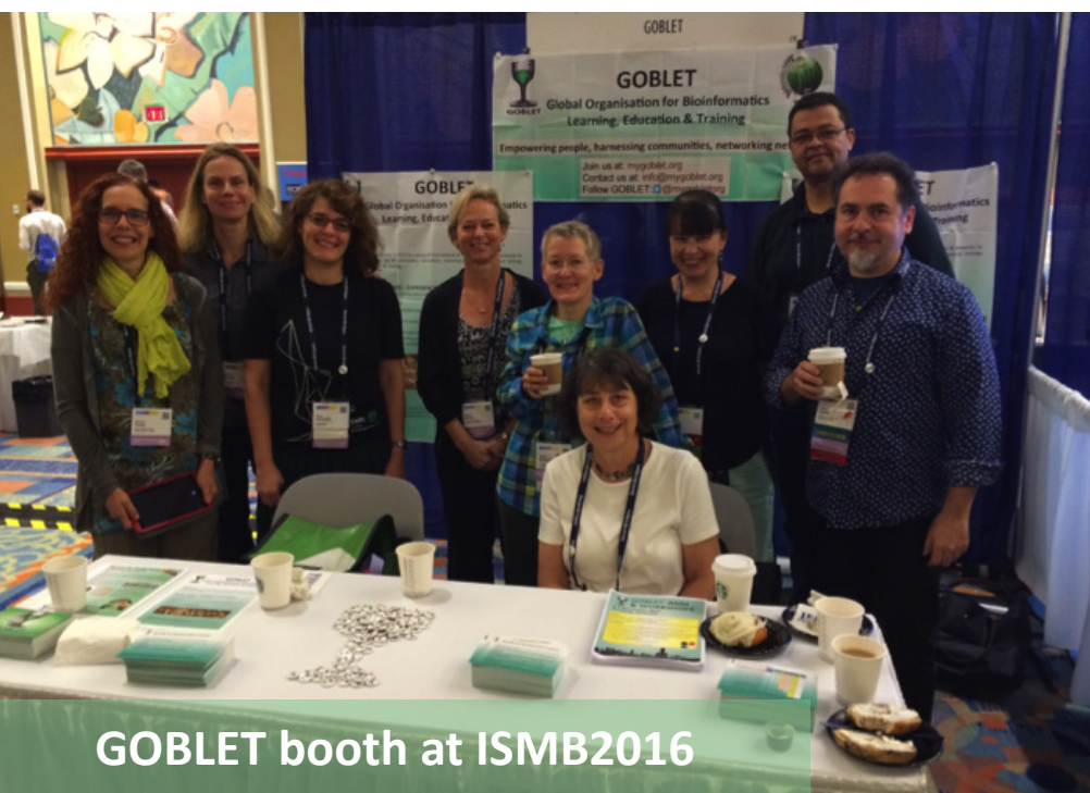
GOBLET booth at ISMB2016

ISMB (Intelligent Systems for Molecular Biology) is the ISCB (International Society for Computational Biology)'s annual international conference, now the largest computational biology and bioinformatics meeting in the world.