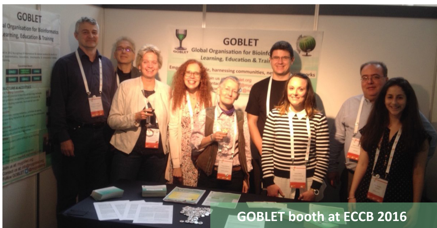
GOBLET booth at ECCB 2016

The GOBLET booth, kindly provided by the ECCB2016 Organisation, and supported by a range of individual and organisational members (from South Africa, Switzerland, Portugal, the UK and the Netherlands), stimulated a lot of interest and promises of new membership.